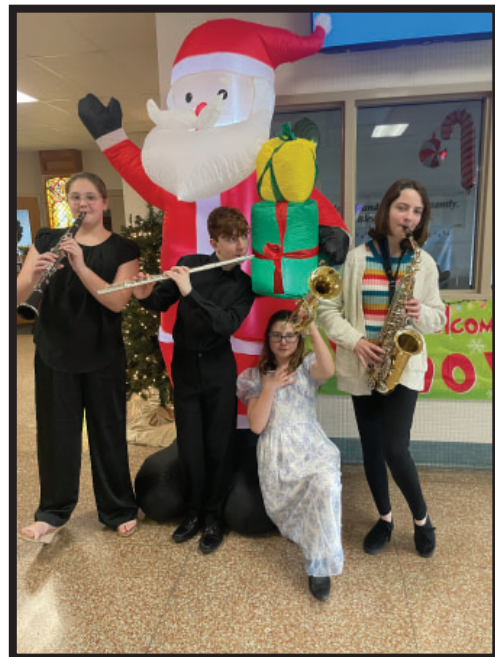
All-County band students