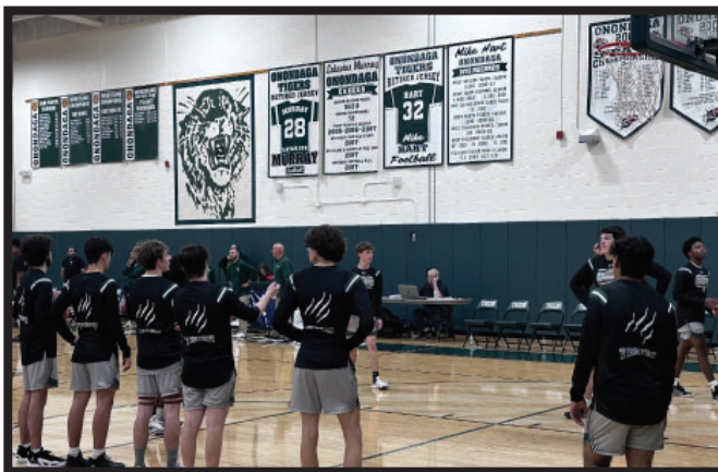
Above Boy's Basketball at game introduction