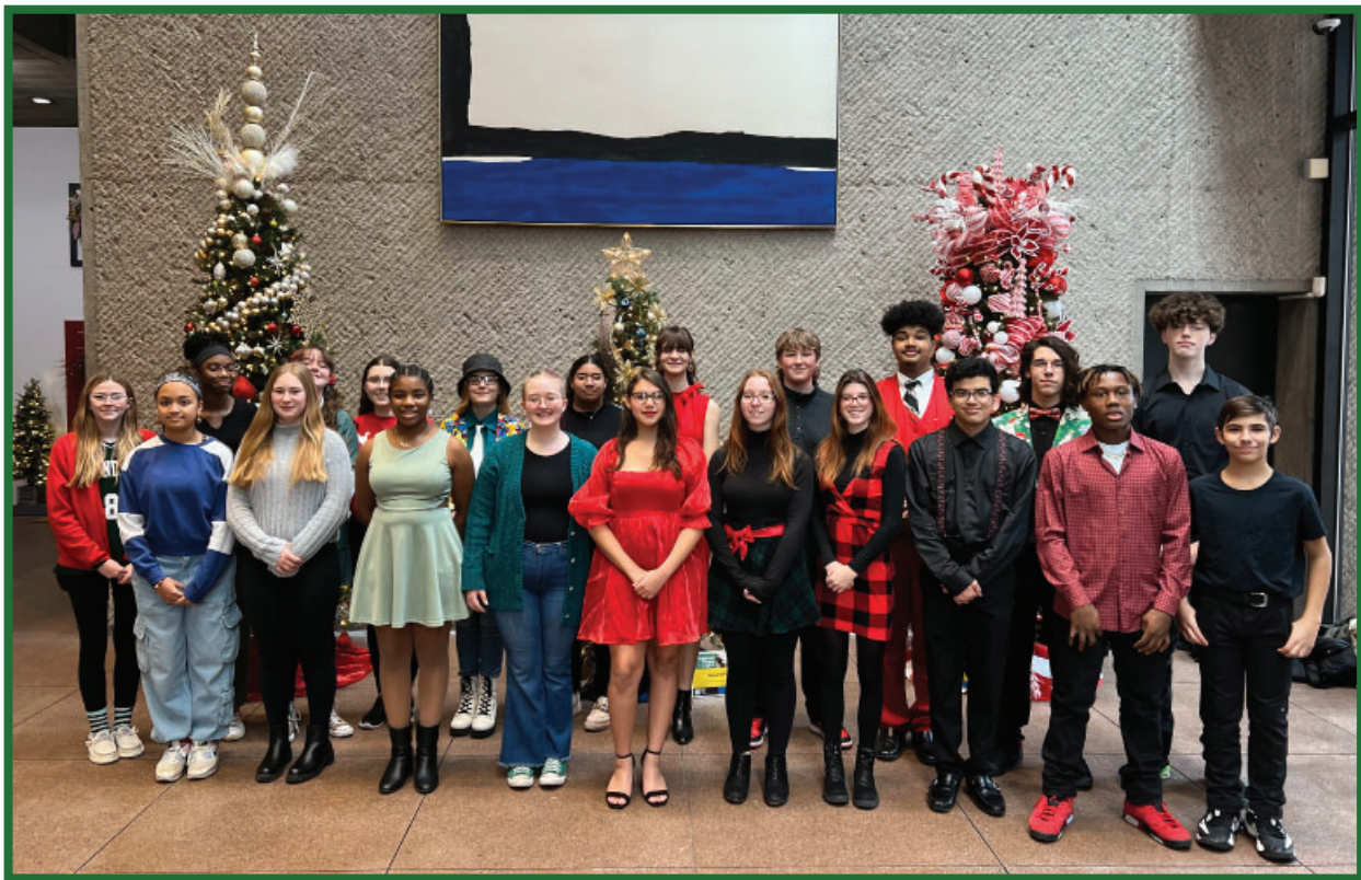
Senior High Chorus performed in the Festival of Trees at the Everson Museum in downtown Syracuse on December 8th.

Onondaga Central Schools wishes you and your family a joyful winter season and new year filled with happiness and hope.