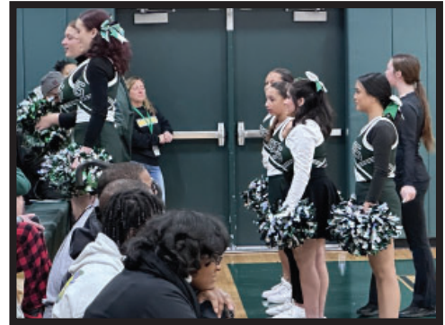
OCS Cheerleaders leading school spirit