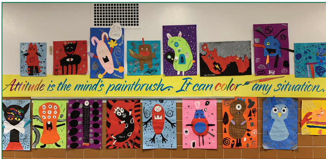
By Wheeler 4th Graders