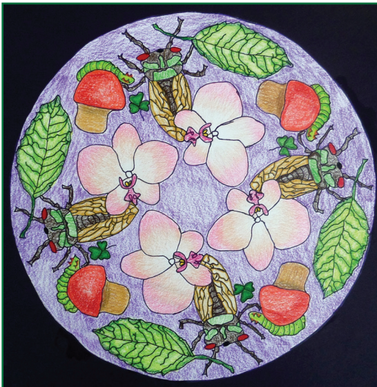
By Daelyn Cousineau